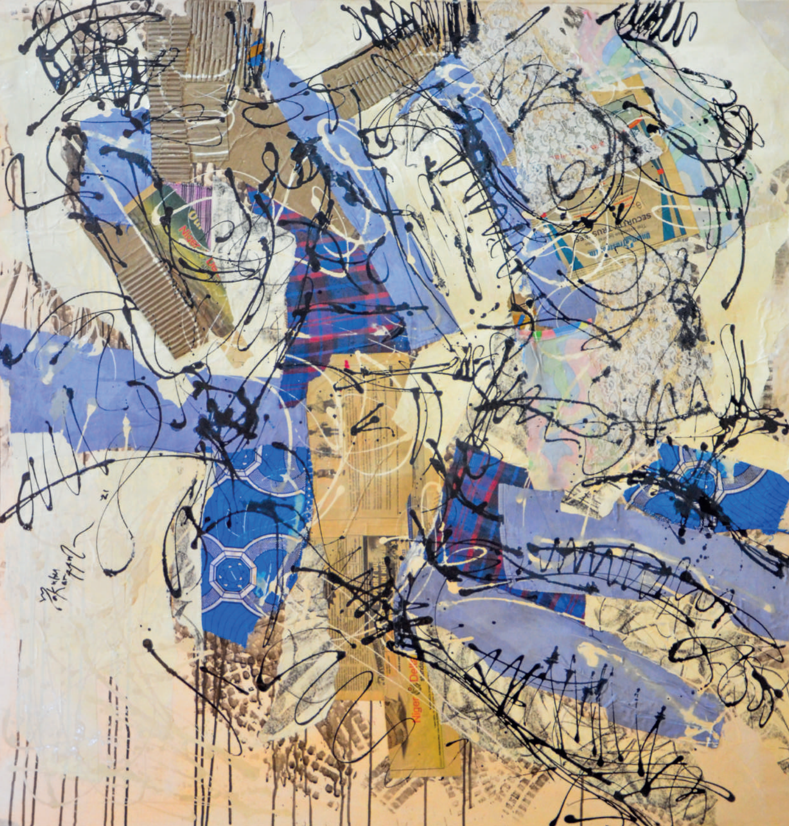
Title: Ghetto Figures II medium: Satin Paint, Fabrics, Papers, Acrylic (Mixed Media On Canvas) Size: Width 138 X Height 129cm Year: 2021