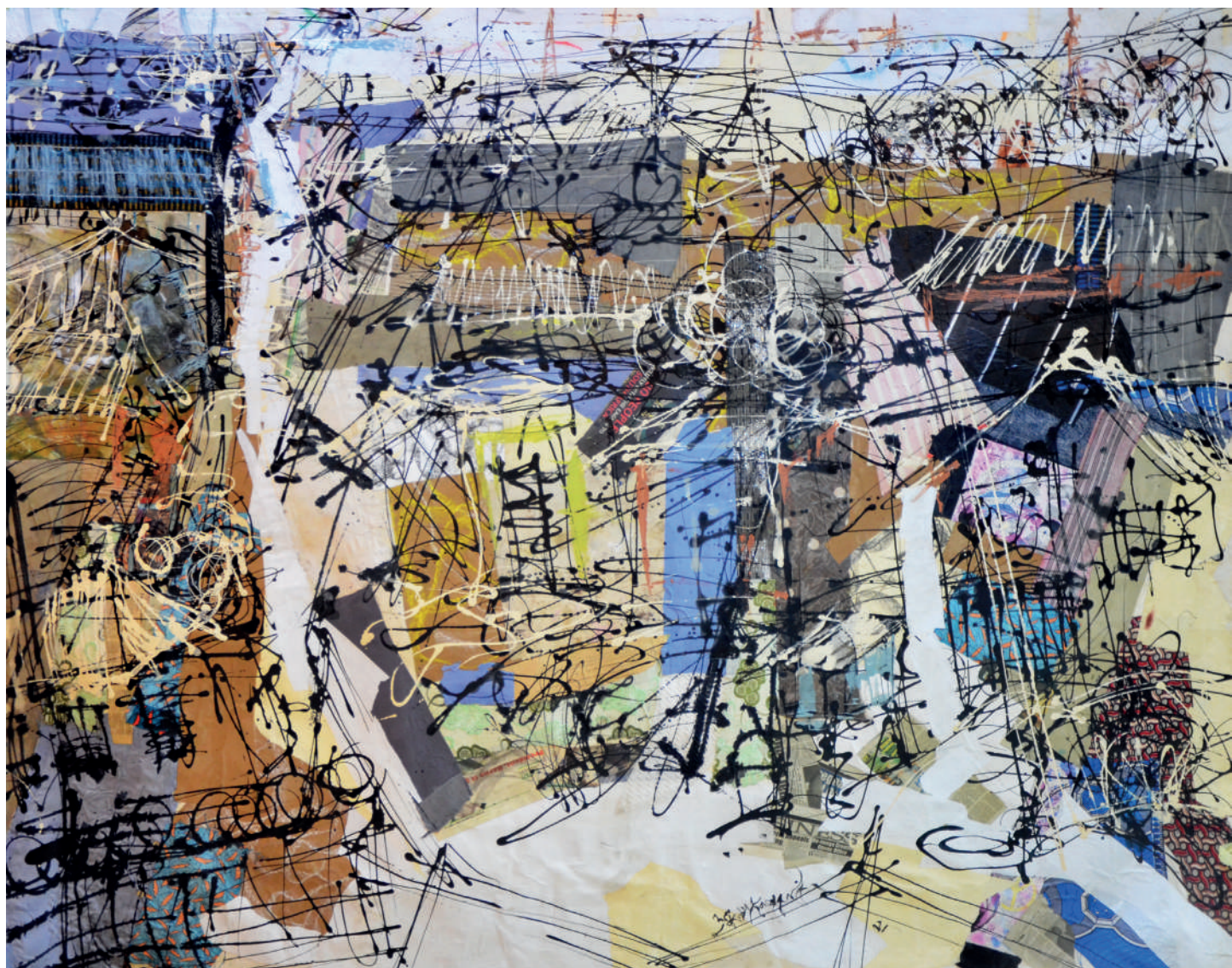
Title: Ghetto Phase II Medium: Mixed Media on Canvas - Papers, Acrylic, Gloss Paint, Pastel, Fabrics Size: Width 227 cm x Height 187 cm Year: 2021