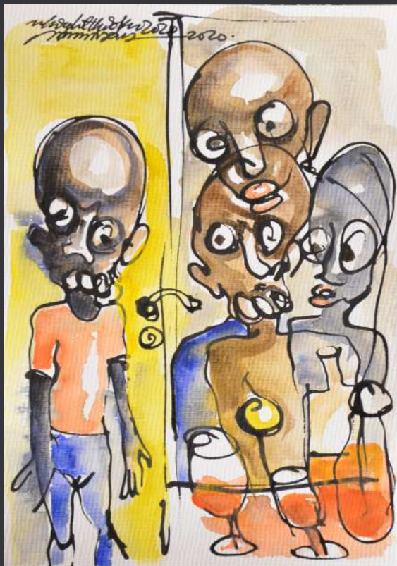
Series: "Talklesstalk" Title: "The Wallgeckor" Narrative: Knock And Talk... The Liquor Table, You Can't Get There From Here... Medium: Watercolour On Paper Size: 29.7Cm X 42Cm Year: 2020 Artist: Ibiok Bright