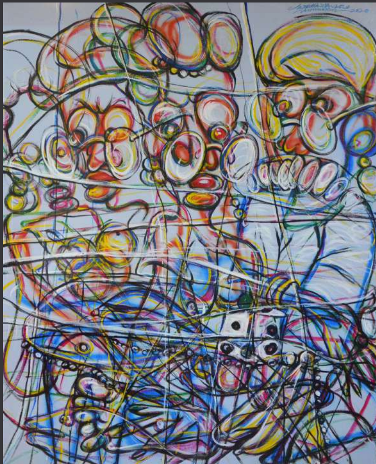
Series: "Talklesstalk" Title: "Bookie Bunko" Narrative: Thief Among Thieves... The Monkey Laugh... Medium: Oil On Canvas Size: 152.4Cm X 182.88Cm Year: 2020 Artist: Ibiok Bright