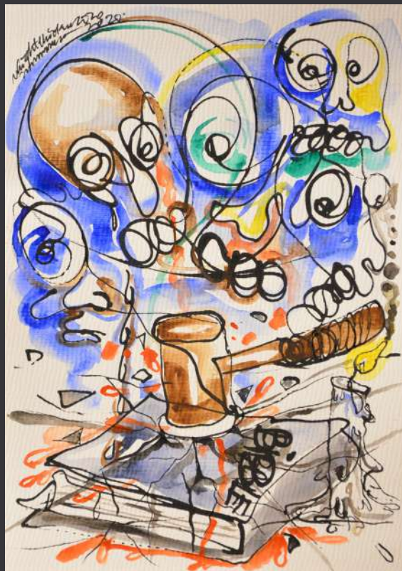
Series: "Talklesstalk" Title: "The Smiles Of Cloud" Narrative: Breaking Bible... Premonition... Medium: Watercolour On Paper Size: 29.7Cm X 42Cm Year: 2020 Artist: Ibiok Bright