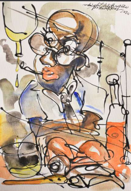
Series: "Talklesstalk" Title: "The Organic Magician" Narrative: Urine Is Pure... Urine Break Charm... Medium: Watercolour On Paper Size: 29.7Cm X 42Cm Year: 2020 Artist: Ibiok Bright