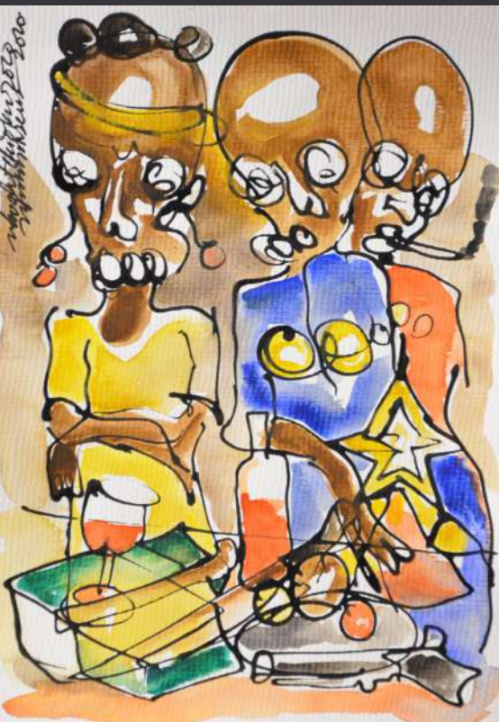
Series: "Talklesstalk" Title: "The Problem Choice" Narrative: Hatred From Every Corner... I Love The Rock Star... Medium: Watercolour On Paper Size: 29.7Cm X 42Cm Year: 2020 Artist: Ibiok Bright