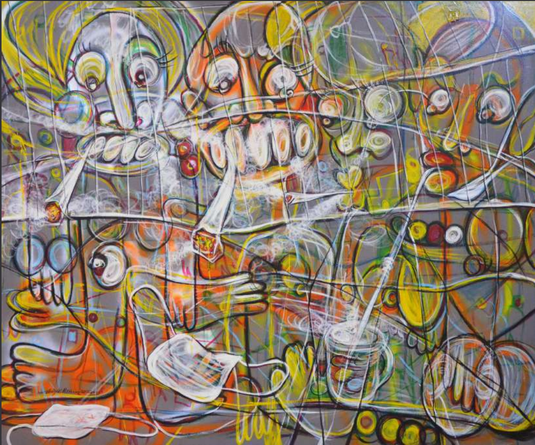
Series: "Talklesstalk" Title: "The Philanderers" Narrative: Communion Of Friends... Medium: Oil On Canvas Size: 152.4Cm X 182.88Cm Year: 2020 Artist: Ibiok Bright