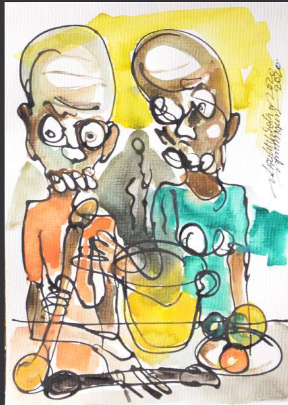
Series: "Talklesstalk" Title: "The Turning Stick" Narrative: Hand That Sees...Use It... Medium: Watercolour On Paper Size: 29.7Cm X 42Cm Year: 2020 Artist: Ibiok Bright