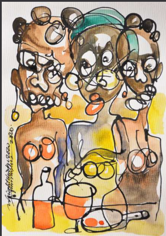
Series: "Talklesstalk" Title: "The Forming Faces" Narrative: Mirror Capture Wine... If Only They Are Looking Mirror... Medium: Watercolour On Paper Size: 29.7Cm X 42Cm Year: 2020 Artist: Ibiok Bright